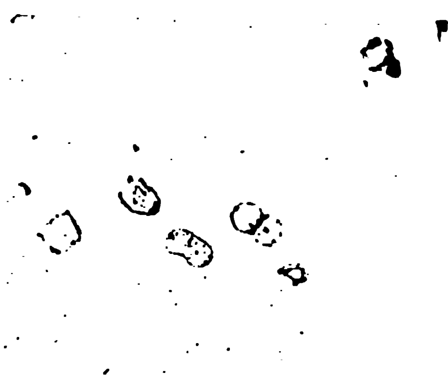
Plate 1. Plutonium metal. Mechanically polished with tin oxide and ethyl alcohol. X 500. (A. Gerds, July 27, 1944.) The inclusions can be identified as plutonium hydride.